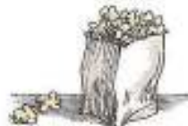
12. a bag of popcorn