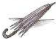
10. an umbrella