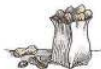
11. a bag of peanuts