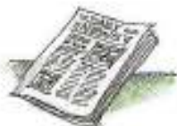
9. a newspaper